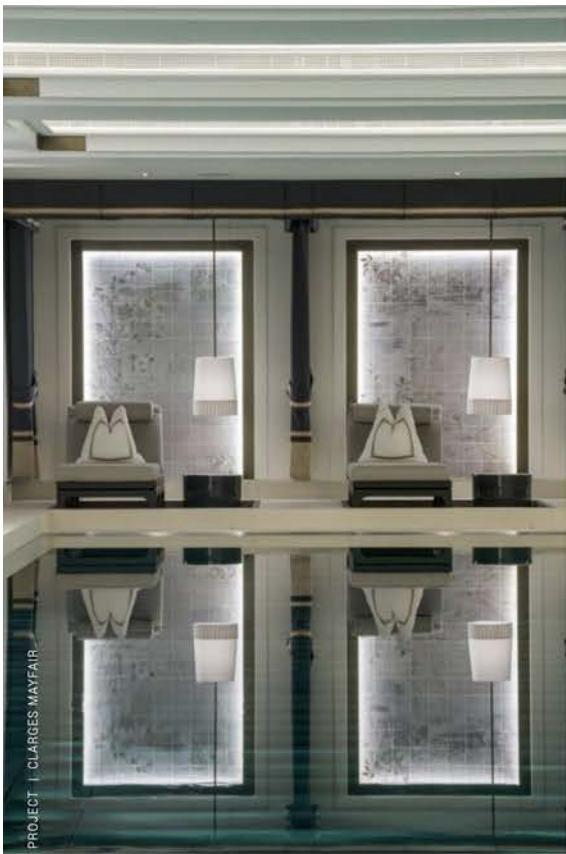
PROJECT | CLARGES MAYFAIR